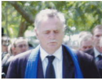
TOYS CHANGE LIVES MOVING INTO THEIR OWN PREMISES