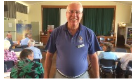
RUSSELL ~ CALLING IT QUILTS